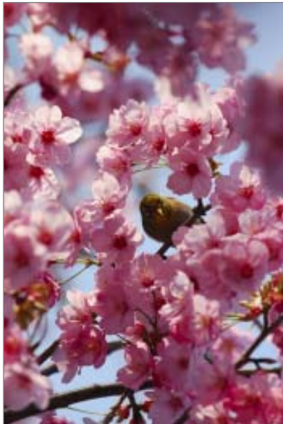
DC is home to the Cherry Blossom Festival.