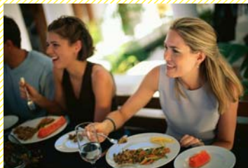
We might not be this youthful; however, we'll have just as much fun!

Location: IHOP restaurant on Fowler Ave. near the intersection of I-75