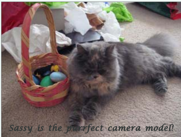
Sassy is the purrfect camera model!